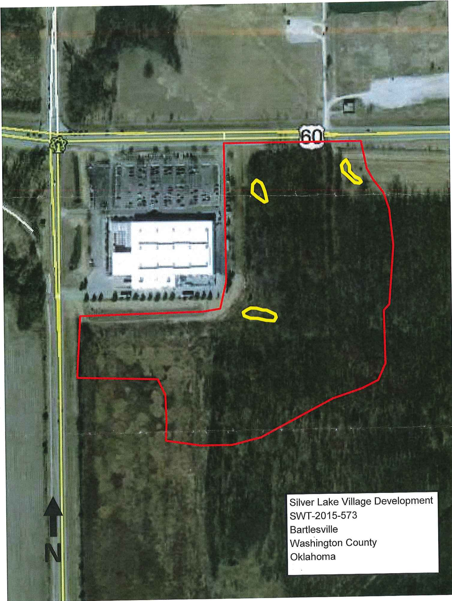
Silver Lake Village Development SWT-2015-573 Bartlesville Washington County Oklahoma